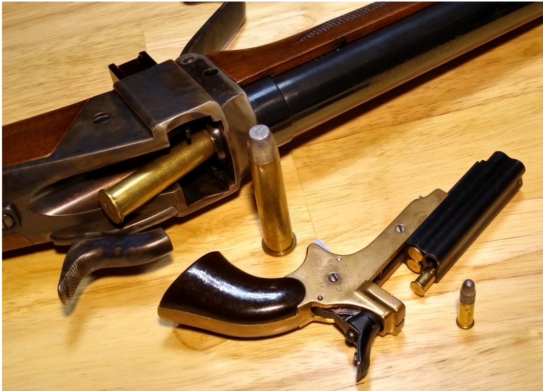
A reproduction Sharps Derringer .22 made by Miroku, next to a more common example of a Sharps rifle in .45-70 (also a reproduction).